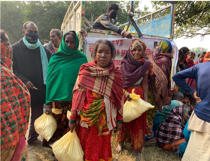
Covid-19 relief being distributed to community