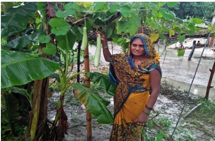
A women showing her kitchen garden in the backyard of her house