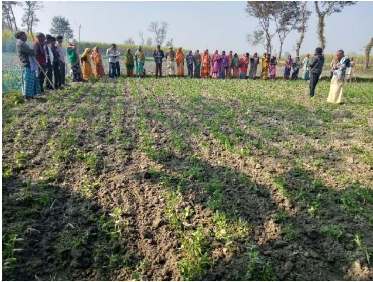
An exposure visit of farmers organized to showcase improved package of practices in farmer's field